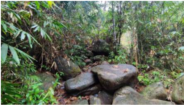
Lowland rain forest (secondary)