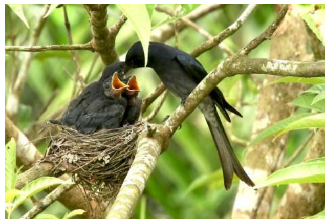
White bellied Drongo