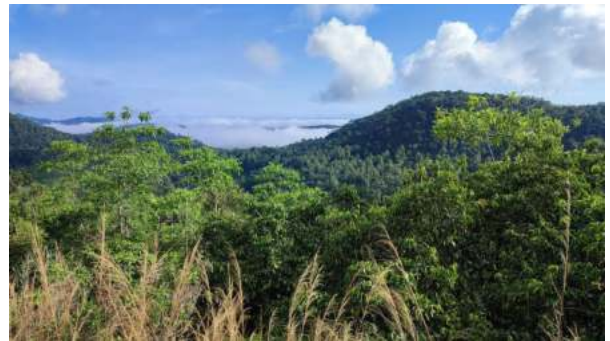
Lowland rain forest (secondary)