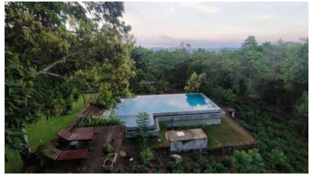
Garden of the resort