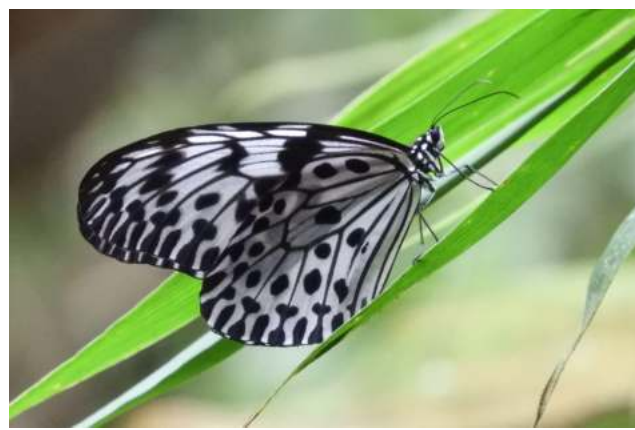
Sri Lankan Tree-Nymph