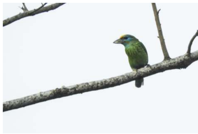
Sri Lanka Yellow-fronted Barbet