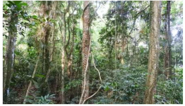
Lowland rain forest (secondary)