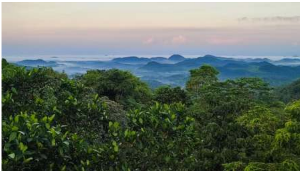
Garden of the resort