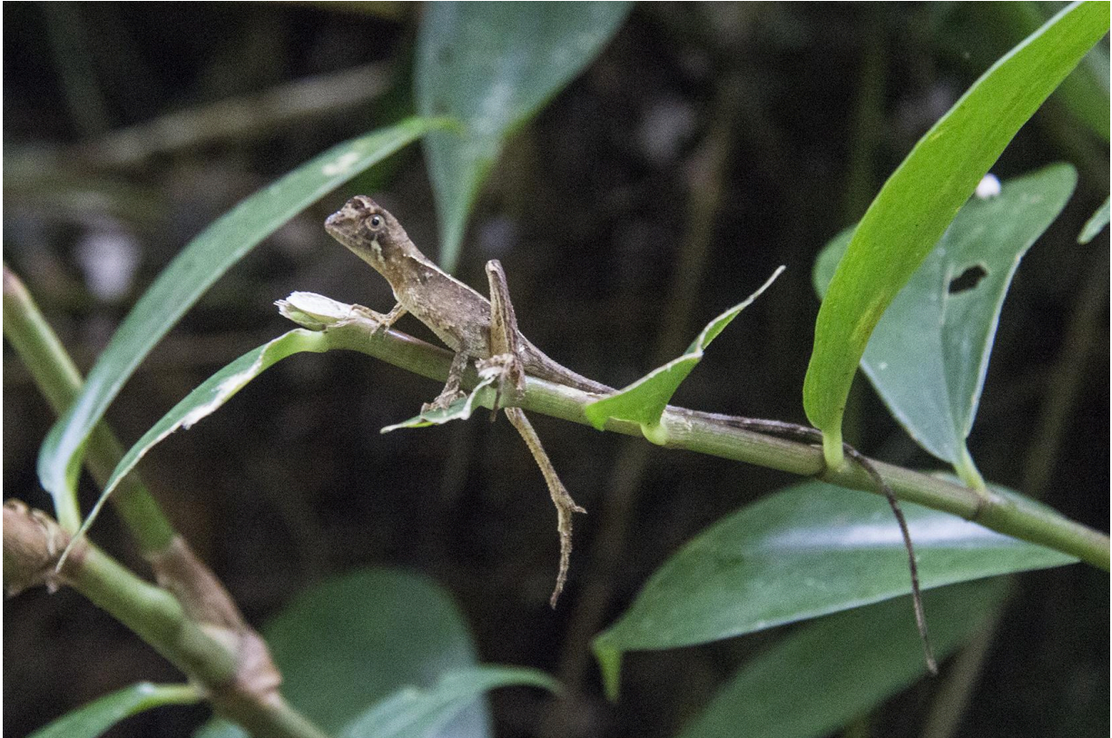
Sri Lankan kangaroo lizard