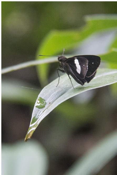
Common Banded Demon