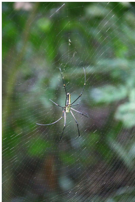
Giant wood spider